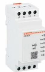
Multifunction voltage and frequency monitoring relays with NFC technology PMV95N